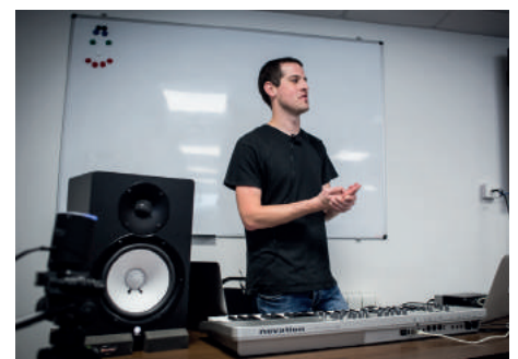
Innovative classroom delivery