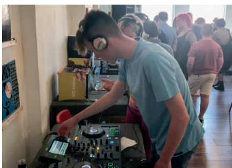
Practical learning sessions