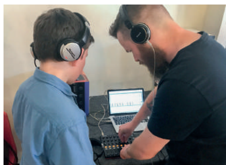
One-to-one creative development